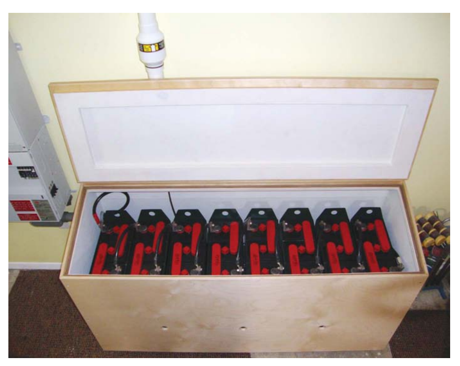
A peek inside this battery enclosure shows a clean installation, with ample room for the battery cases and interconnects.

Battery boxes aren't always made from plywood. This example is fabricated from stainless steel.