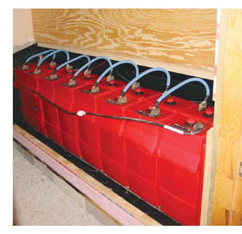
This battery box, with a removable front, makes future battery replacement easier.

Finally, the NEC Handbook includes the following reference to flooded versus sealed batteries: "Although valve-regulated batteries are often referred to as 'sealed,' they actually emit very small quantities of hydrogen gas under normal operation, and are capable of liberating large quantities of explosive gases if overcharged. These batteries therefore require the same amount of ventilation as their vented counterparts" (Article 480.9).