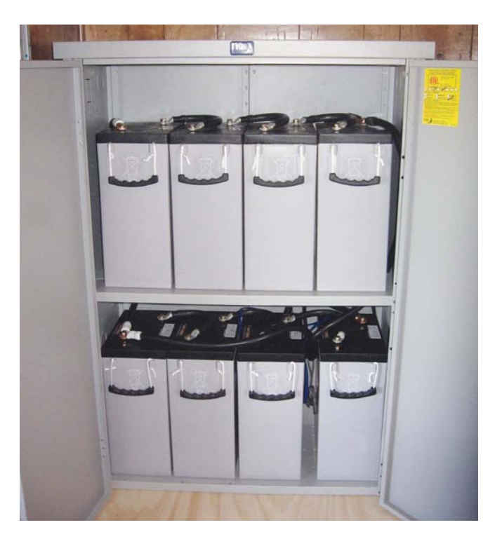
This battery enclosure allows for stacking batteries, reducing the footprint required. This is one clear benefit of sealed batteries, as access to cell caps to add water is unnecessary.

in a cold environment. Insulation slows the rate of heat loss from a warm space or object to a cooler space. Batteries are not a significant heat source; the normal charge/discharge process produces a negligible amount of usable heat. No amount of insulation will prevent batteries from eventually reaching the temperature of the environment around the insulated box, so while insulation may be included, it's important to locate the box in a tempered space. Batteries like to live at about the same temperatures humans enjoy. For optimal battery performance and longevity, select a location and enclosure design that will keep your batteries between 50°F and 75°F.